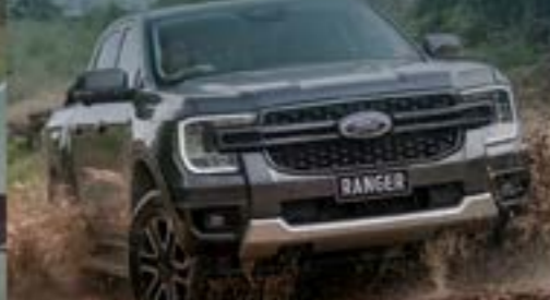
PLUS a Next-Gen Ranger 4X4 Wildtrak