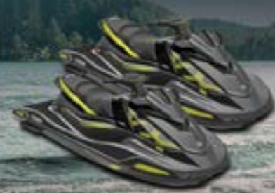
PLUS 2 X Yamaha VX Deluxe Jet Ski with trailer