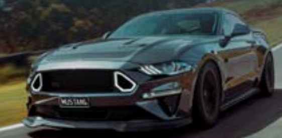
WIN a Supercharged Mustang RTR Spec 3